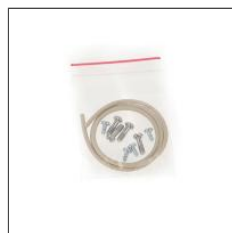
Hardware includes lid screws, PC board screws, and gasket