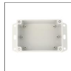
Internal mounting points for PC boards or panels