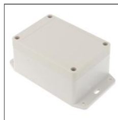
Opaque Lid (ABS version shown)