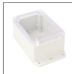
Clear Lid (polycarbonate version shown)