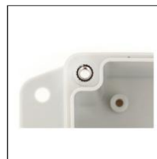
Features corrosion resistant inserts for lid assembly