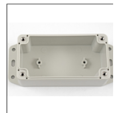
Internal DIN rail mounting point.