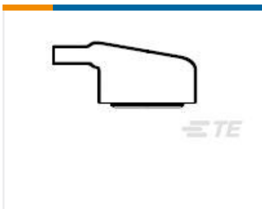
TE Part #136852-000 234A011-100-0