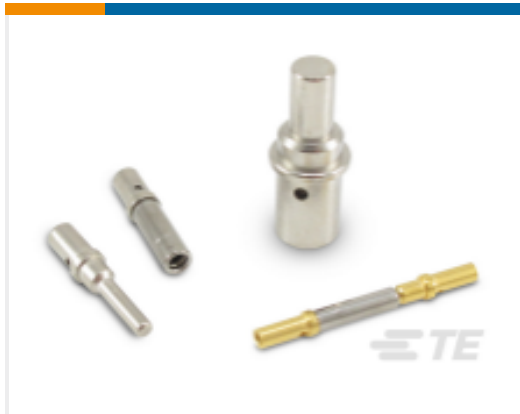
TE Part #0462-209-16141 DEUTSCH SOLID CONTACTS