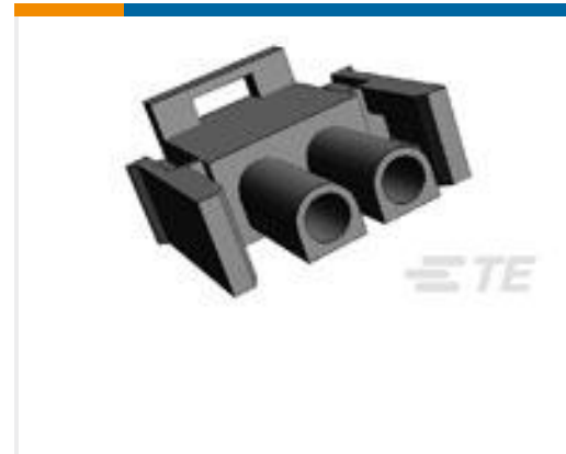
TE Part #1-480698-0 02P UMNL PLUG HSG NATL